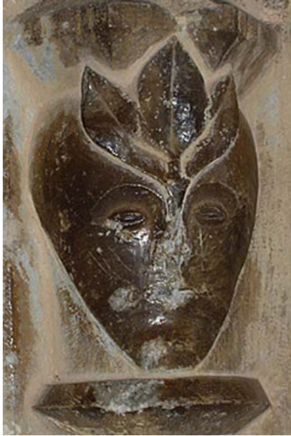
Fig 1 : St Bertrand Tree Nose

In the cloister of St Bertrand des Comminges, Haut Garonne, lurks this mysterious ancient mask with foliage growing on the forehead :