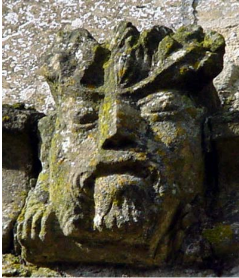
Fig 8 : Chadlington Tree Nose

Recently, Tim Healey www.greenmantrail.co.uk sent me this superb example of a Tree Nose from Chadlington, in Oxfordshire :