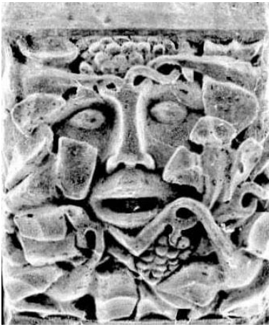
Fig 5 : Pinchbeck Tree Nose