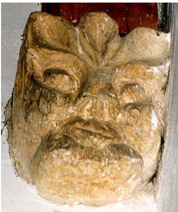
Fig 7 : Wilbarston Tree Nose