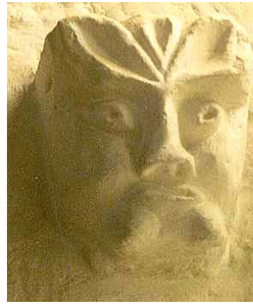
Fig 6 : Kettering Tree Nose