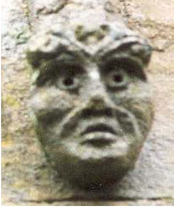
Fig 3 : Gosberton Tree Nose