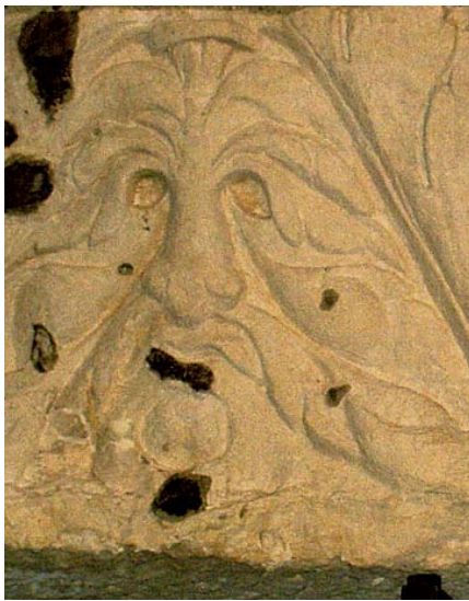
Fig 9 : Vesunna Green Man

It seems that the Tree Nose is a simplified version of “the face made of leaves”, and as such, qualifies to be a foliate head or Green Man. My final photograph is Gallo-Roman, 1 st century AD, from Vesunna Museum in Périgueux.